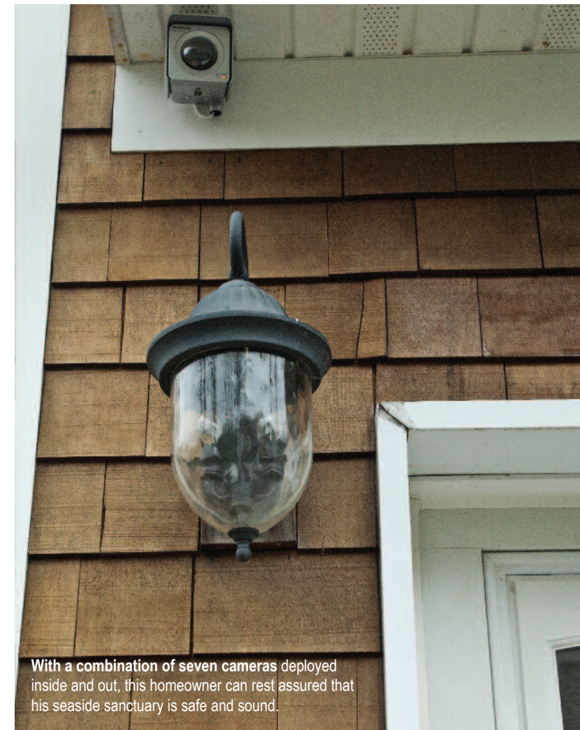
With a combination of seven cameras deployed inside and out, this homeowner can rest assured that his seaside sanctuary is safe and sound.