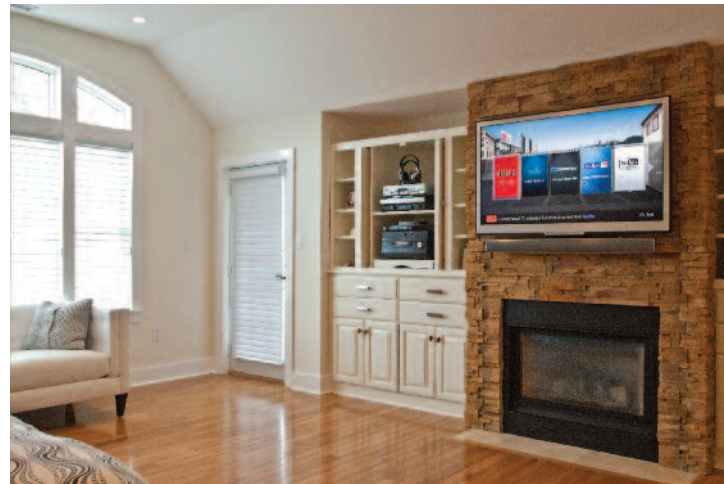
The home's master suite is one of three locations that feature a controlled video location, which can control or override every other system in the house.

And to think, you can manage all of this state-of-the-art technology without even being on the premises, since Control4 allows users the capacity to access and manipulate their systems from anywhere in the world, with anything that can get online, including laptops, iPads, iPhones and Blackberrys. So, the next time you're headed from your primary residence to your Eastern Shore summer house, get it ready for you by setting the climate, adjusting the lights, queuing the music, checking the cameras, turning off the alarm and even unlocking the doors (including deadbolts) while you're en route. Wright likes to call that grouping of conveniences his "peace-of-mind package."